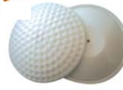
ECO-R211 Golf Tag / Dome

Size: Large \phi 64mm / Midi 55mm / Mini 45mm