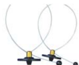
ECO-R301 Milk Tag